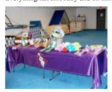
Another Beautiful Trophy Table

The CKCSCNENY conducted its second A/OA Match, Saturday November 13, 2010, an important step in the road to recognition by the American Kennel Club. The venue for this indoor event was the lovely training facility for the Schenectady Dog Training Club in Scotia, N.Y. As expected, there was excellent support in members, exhibits and refreshments. Everything ran smoothly and on time.