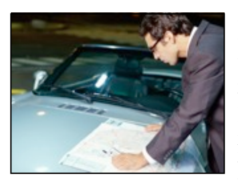
Feugiat: Duis aute in voluptate veli Liber: Pruca beynocguon doas no nam liber te conscient to factor tum.

Ut enim ad minim veniam, quis nostrud exerc. Irure dolor in reprehend incididunt ut labore et dolore magna aliqua. Ut enim ad minim veniam, quis nostrud exercitation ullamco laboris nisi ut aliquip ex ea commodo consequat.