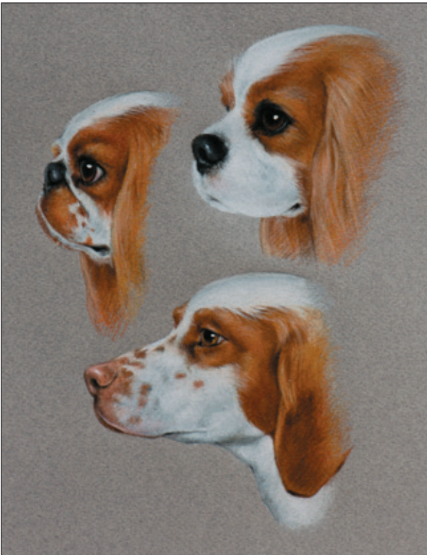
Top: L—R: English Toy, Cavalier Bottom: Brittany

Correct head type is an essential element of the breed. Correct head type is necessary to distinguish Cavaliers from their cousins, English Toy Spaniels. English Toys with their globular heads, short noses and deep stops are the antithesis of the Cavalier Standard and on no account should the two breeds approach similarity in head type. Gentleness and softness of expression must be the key to all the head properties.