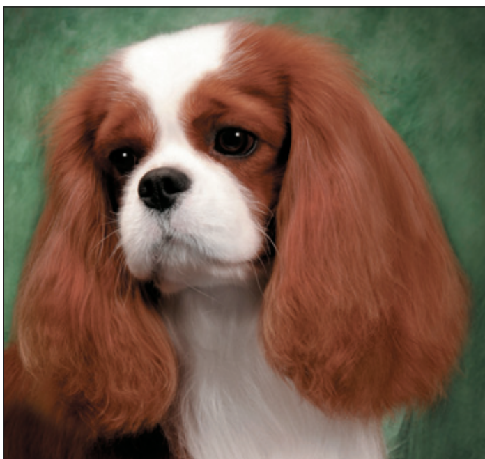
Ears when alert