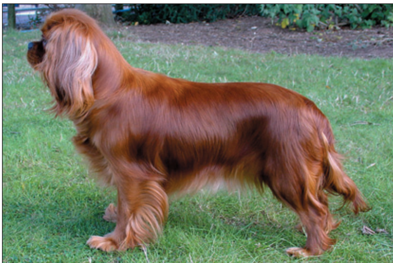
Correct neck, topline, body

Neck – Fairly long, without throatiness, well enough muscled to form a slight arch at the crest. Set smoothly into nicely sloping shoulders to give an elegant look.