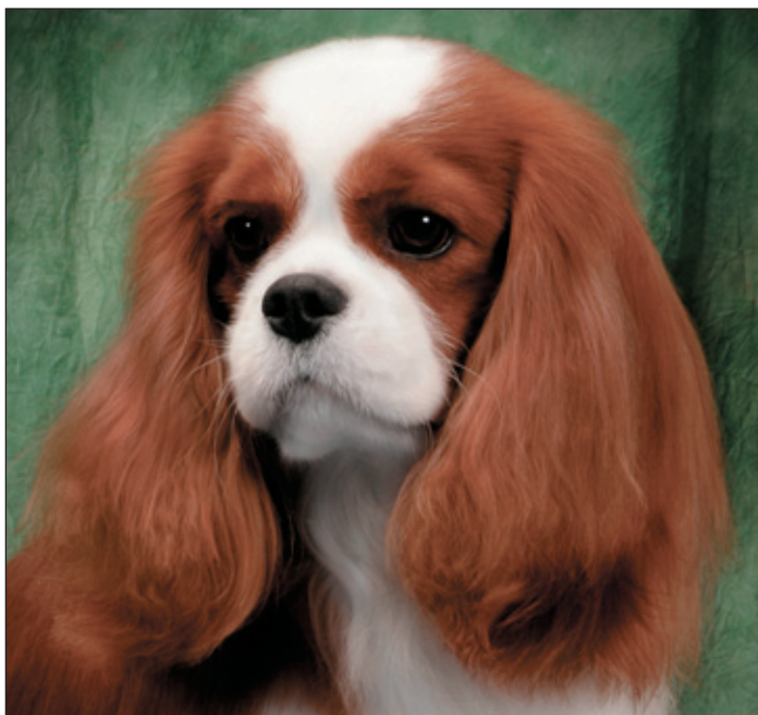
Ears at ease