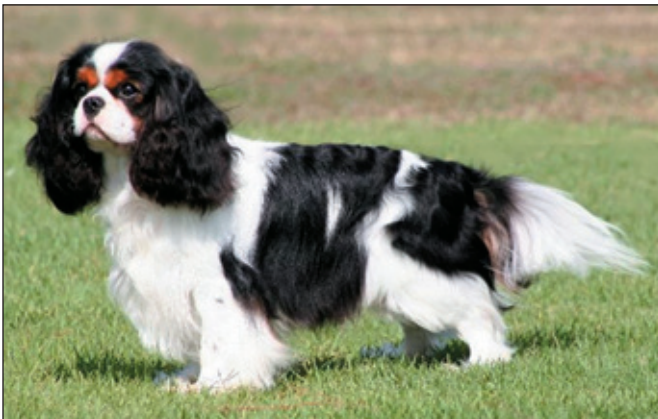
Correct – moderate bone

Substance – Bone moderate in proportion to size. Weedy and coarse specimens are to be equally penalized.