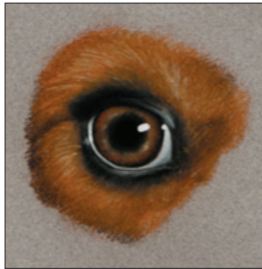
White ring around light eye

The most important feature of the head and, arguably, of the breed, is the eye. Cavalier eyes should be large, round and very dark brown, spaced well apart and looking directly forward. All of the trust and gentleness of the Cavalier's soul is communicated through its lustrous, limpid eyes. A slight cushioning and/or padding ('fill') under the eyes contributes immeasurably to the softness and correctness of expression.