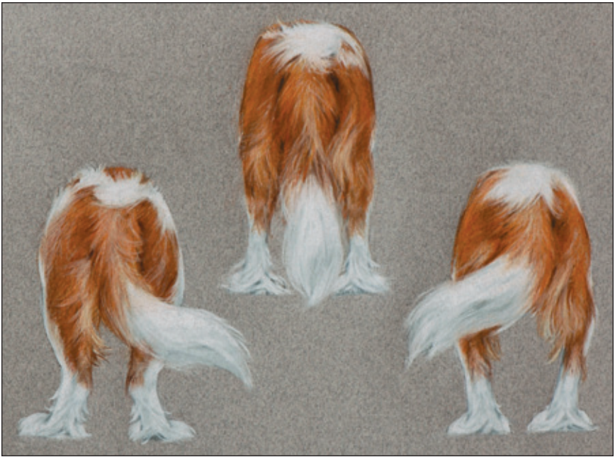
Left—Cow hocked Middle—Correct Right—Bowed hocks

Hindquarters should come down from a good broad pelvis, very slightly sloped to give an attractive tail carriage.