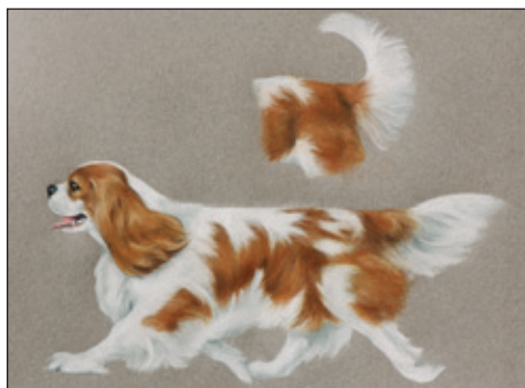
Level topline moving or standing Upper—inappropriate “Gay” tail

Topline – level both when moving and standing.