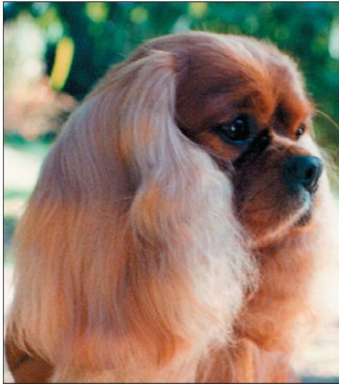
Correct skull, muzzle, stop and ear set

Skull – slightly rounded but without dome or peak; it should appear flat because of the high placement of the ears. Stop is moderate, neither filled nor deep.