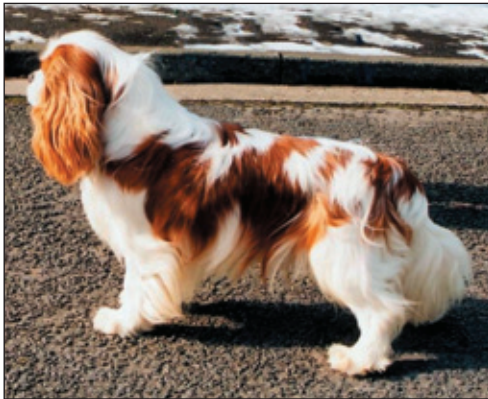
Correct & balanced angulation front and rear

Shoulders well laid back. Forelegs straight and well under the dog with elbows close to the sides. Pasterns strong and feet compact with well-cushioned pads. Dewclaws may be removed.