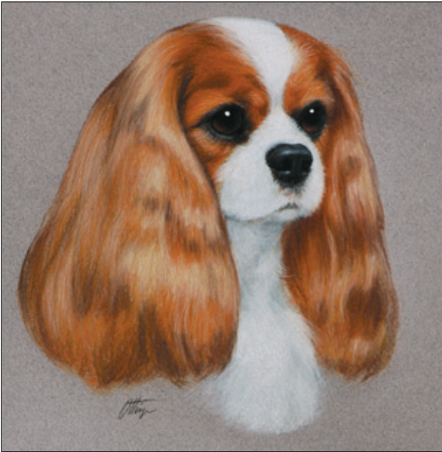
Correct male head