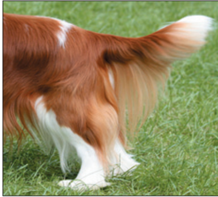
Correct tail in motion

Tail – Well set-on, carried happily but never much above the level of the back, and in constant characteristic motion when the dog is in action. Docking is optional. If docked, no more than one third to be removed.