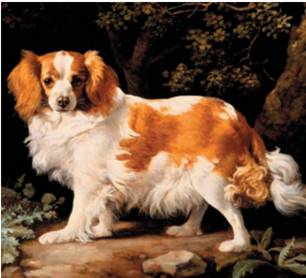
George Stubbs, 1776

The first Cavaliers were sent to America in 1952, and in 1954 a club was formed. Soon after, they sought AKC recognition, but because of their small numbers they were relegated to the Miscellaneous class, where they remained for 17 years. However, in 1993, the American Cavalier King Charles Spaniel Club was formed, and on January 1, 1996 the Cavalier became the 140 th AKC recognized breed.