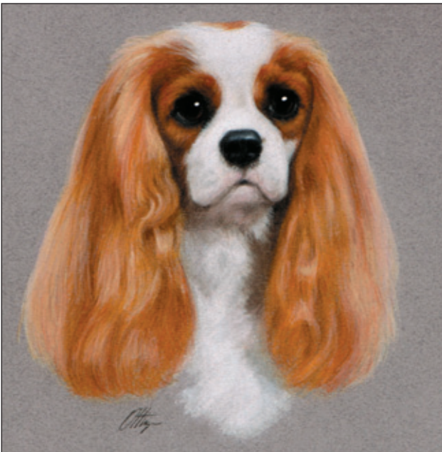
Correct female head