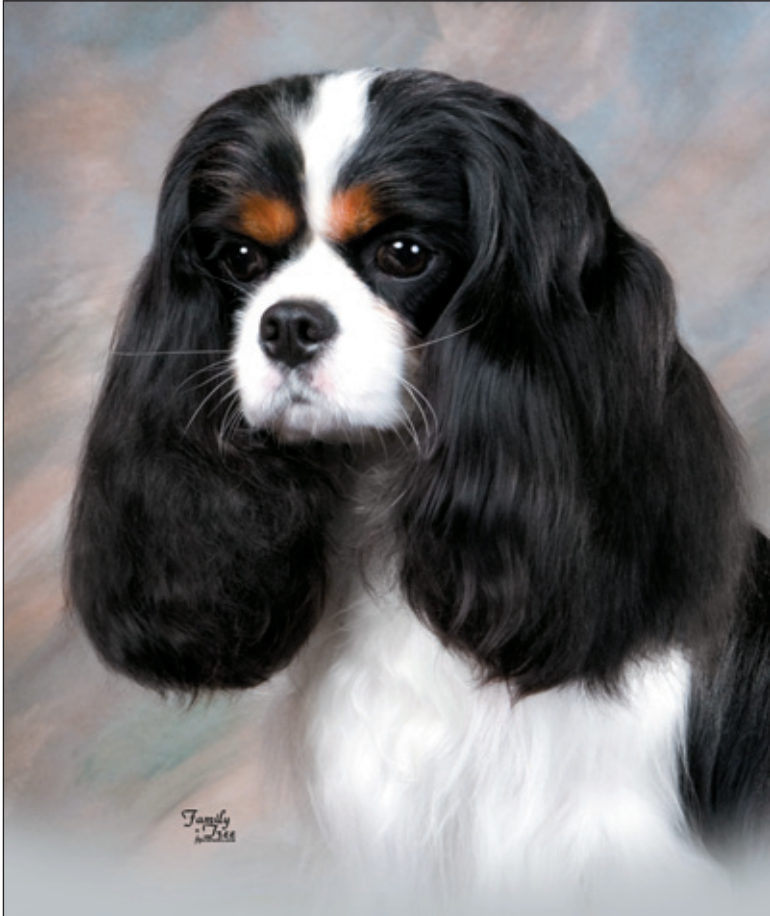
Correct head, ear set, eyes, and muzzle

Soft, sweet, gentle and trusting. No head would be correct without the soft melting expression. This expression is the result of the flat appearing skull and the frontal placement of the large round eyes with slight padding underneath, framed by high-set ears.