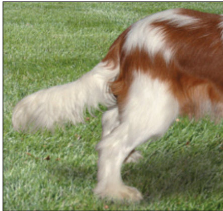
Correct tail at rest

Tail carriage between the two o'clock and four o'clock position is within the acceptable range with three o'clock being the ideal.